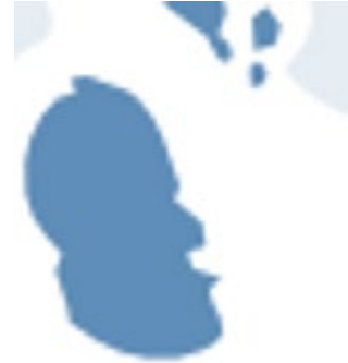
North Ayrshire coast. Including: Arran, Great Cumbrae

The journal article was on the topic of dementia and the report was on social prescribing.