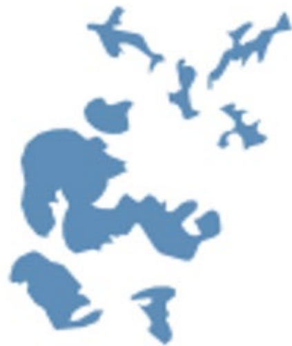
Orkney Islands. Including: Mainland, South Ronaldsay, Westray, Sanday, Hoy, Burray, Stronsay, Shapinsay, Rousay, Eday, Papa Westray, Flotta, North Ronaldsay

The main topic covered was telehealth (3 works). Other topics included alcohol consumption, public health, a general practitioner’s perspective, and climate change.