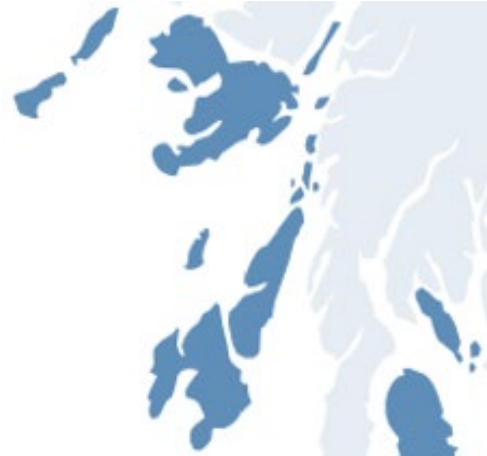
Argyll & Bute coast. Including: Bute, Islay, Mull, Tiree, Seil, Luing, Jura, Coll, Lismore, Iona, Gigha, Colonsay, Eilean Loain, Easdale, Kerrera