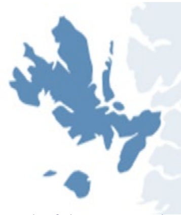
Isle of Skye & surrounding islands: Scalpay, Raasay The Small Isles: Eigg, Muck, Rum, Canna, & Sanday

This set of works included a major study entitled 'Social geographies of rural mental health' funded by Economic and Social Research Council (study ID 9). It was set in the Scottish Highlands, with fieldwork being conducted on the Isle of Skye and three other areas. The study generated a number of outputs, 15 of which were included in the review (four journal articles, one book chapter, 10 reports). These works examined many different aspects of rural mental health, including the perspectives of mental health service users, their carers, and service providers; social differences in the rural communities; spatial variations in service provision and support networks; and experiences of inclusion/exclusion, resilience, of using drop-in centres, and rural idylls/hells. The series of reports from the study include an introductory edition that briefly lays out the findings per report (Philo, Parr, and Burns, 2002a) and a final summary report of the overall findings (Philo, Parr, and Burns, 2003).