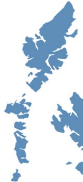
Western Isles. Including: Isle of Lewis & Harris, South Uist, Benbecula, North Uist, South Uist, Barra, Great Bernera, Grimsay, Eriskay, Vatersay

A wide range of topics were examined. The main topics covered were communities (8 works, including 2 on responses to the Covid-19 pandemic), depression (5 works), cultural heritage (4 works), telehealth (3 works), social prescribing (3 works), dementia (2 works), and fuel poverty (2 works). Other topics covered included public health, climate change, cancer distress, sensory impairment, social work, Celtic culture, children and young people's mental health, suicide prevention training, domestic abuse, access to primary care, development of a mental health questionnaire, and 'blue' health (in this case, the benefits of sea-kayaking).