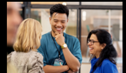
31 Business and Tourism