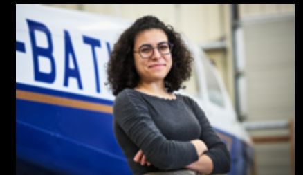
29 Engineering and Technology