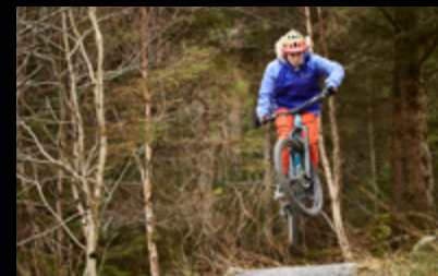
23 Sports and Adventure