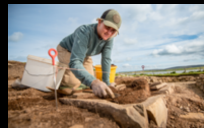
25 Culture, History and Language