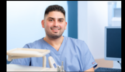
27 Education, Health and Wellbeing