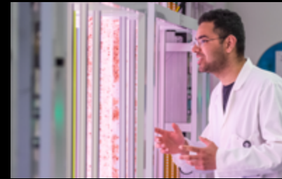
19 Nature and Environment