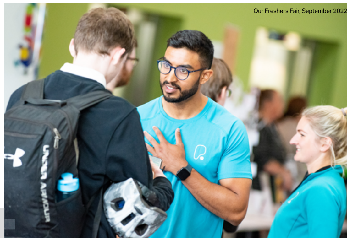
Our Freshers Fair, September 2022

As a UHI student you are automatically a member of the Your Students' Association.